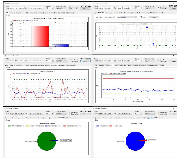
Figure 2. Graphs from the analysis application.

As established in stage 6 of the methodology, at a certain point, the system programming was also carried out, improved, adapted, and corrected during the execution of the research.