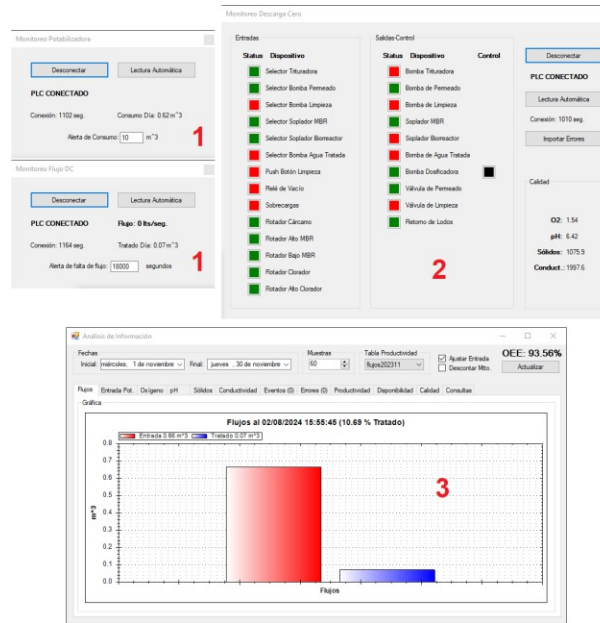
Figure 1. SCADA-type system modules.

The first of the applications has been slightly modified so that, when measuring inflow, it alerts if a certain consumption level is reached, and when monitoring outflow, it alerts if a certain time elapses without any flow being recorded.