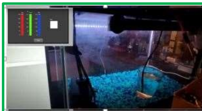
Figure 1. Sample data on luminosity.

The results obtained, shown in Figures 1, 2, 3, and 4, demonstrate effective control of each monitored variable. In the case of luminosity (Figure 1), an adequate light spectrum was maintained in the blue-violet range (370–500 nm), which is key for photosynthesis in the zooxanthellae present in the coral. This control contributed directly to the constant opening of the polyps and improved pigmentation of the coral tissue.