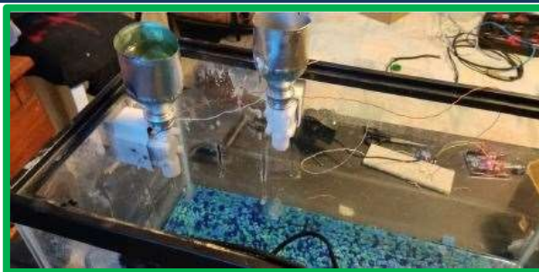
Figure 4. pH control.